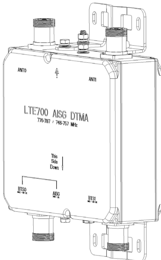
Figure 1 TY-DTMA700-12-AISG Twin TMA

Full Band TMA facilitates simplified logistics, especially when the frequency bands are scattered. The unit comprises of high performance filters, dual balanced high linearity low noise amplifiers with circuits for active bias, supervision, alarms and lightning protection circuit. The TYCC TMA design with all active components integrated within the filter body provides an extremely reliable, compact and lightweight TMA solution. The vented enclosure design is employed to prevent the effect of condensation, thereby guaranteeing long, reliable, maintenance-free service in all environmental conditions. These TMAs offer an easy to install, maintenance free, cost effective solution for coverage enhancement and increased quality in mobile communication networks.